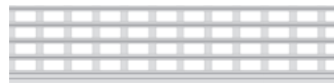
Even design arrangement