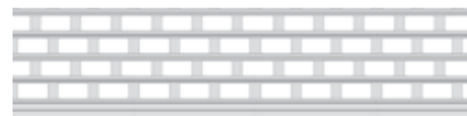
Offset design arrangement