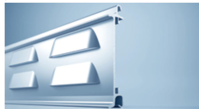
Ventilation profile for clockwise and counterclockwise rollers